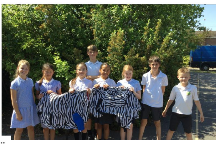
Rode Heath Primary School

Here are some of the children with their final creations! 🍄