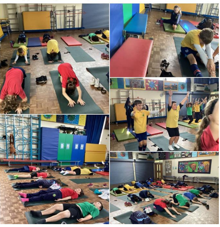
Cross Country Runners (1st Race) 3rd position!