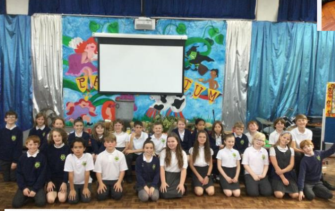
AMAVEN P.E Skills for everyone yesterday!